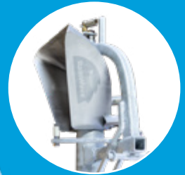
RainWave™ Achieves a wider spread.