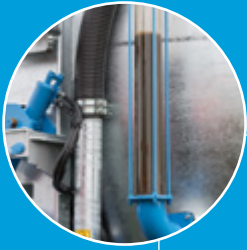
Tank Sight Glass For easy viewing of effluent level