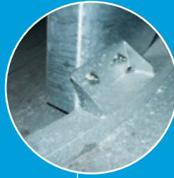
Steel Implosion Rings Built into tank for increased durability